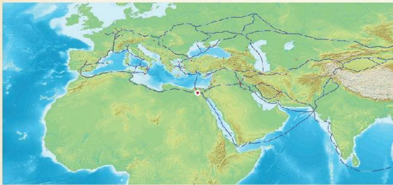
Map of Eurasia showing the trade network of the Radhanites, c. 870 CE, as reported in the account of ibn Khordadbeh in the Book of Roads and Kingdoms.

A thousand years ago, one of the most important centres of Jewry in the world, particularly in the East, was the community of Old Cairo (Fustāt). The Fustāt community was a centre of considerable social, economic, and religious activity. This community had close connections with the Jewish communities of Babylon, The Land of Israel, Spain, Sicily, North Africa, India, Yemen, and others.