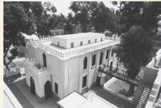
Ben Ezra Synagogue after the renovation

The Jewish Community of Fustāt was divided between Babylonian and Palestinian Synagogues. The later followed the custom of the Land of Israel and worshipped at the Ben Ezra Synagogue. One of the rooms in this synagogue was utilised as a Genizah, or depository, from the eleventh to the nineteenth centuries.