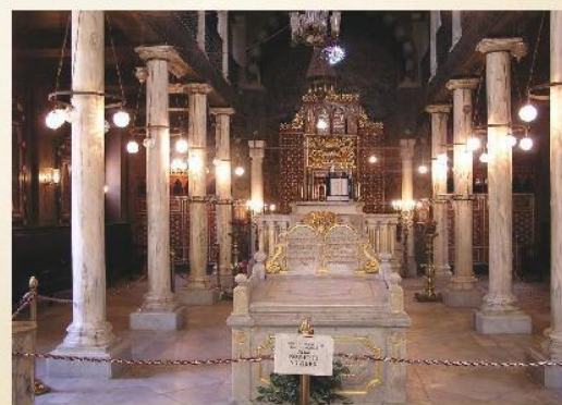
Ben Ezra Synagogue today