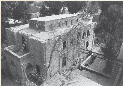
Ben Ezra Synagogue before the renovation