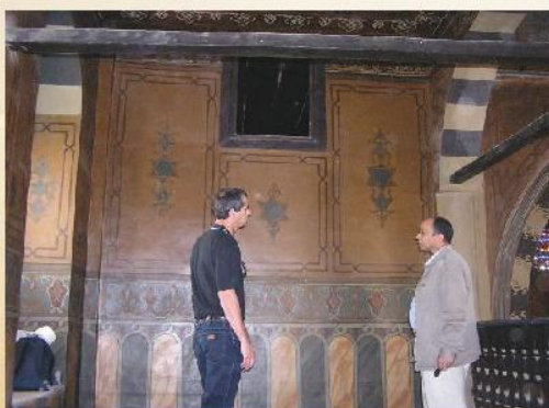
The entrance to the Genizah

The Jewish Community of Fustāt was divided between Babylonian and Palestinian Synagogues. The later followed the custom of the Land of Israel and worshipped at the Ben Ezra Synagogue. One of the rooms in this synagogue was utilised as a Genizah, or depository, from the eleventh to the nineteenth centuries.